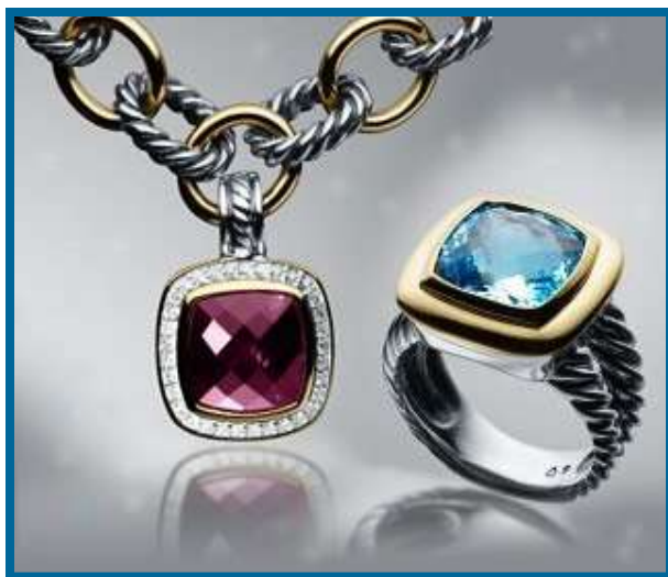
PAJ v. Hanover