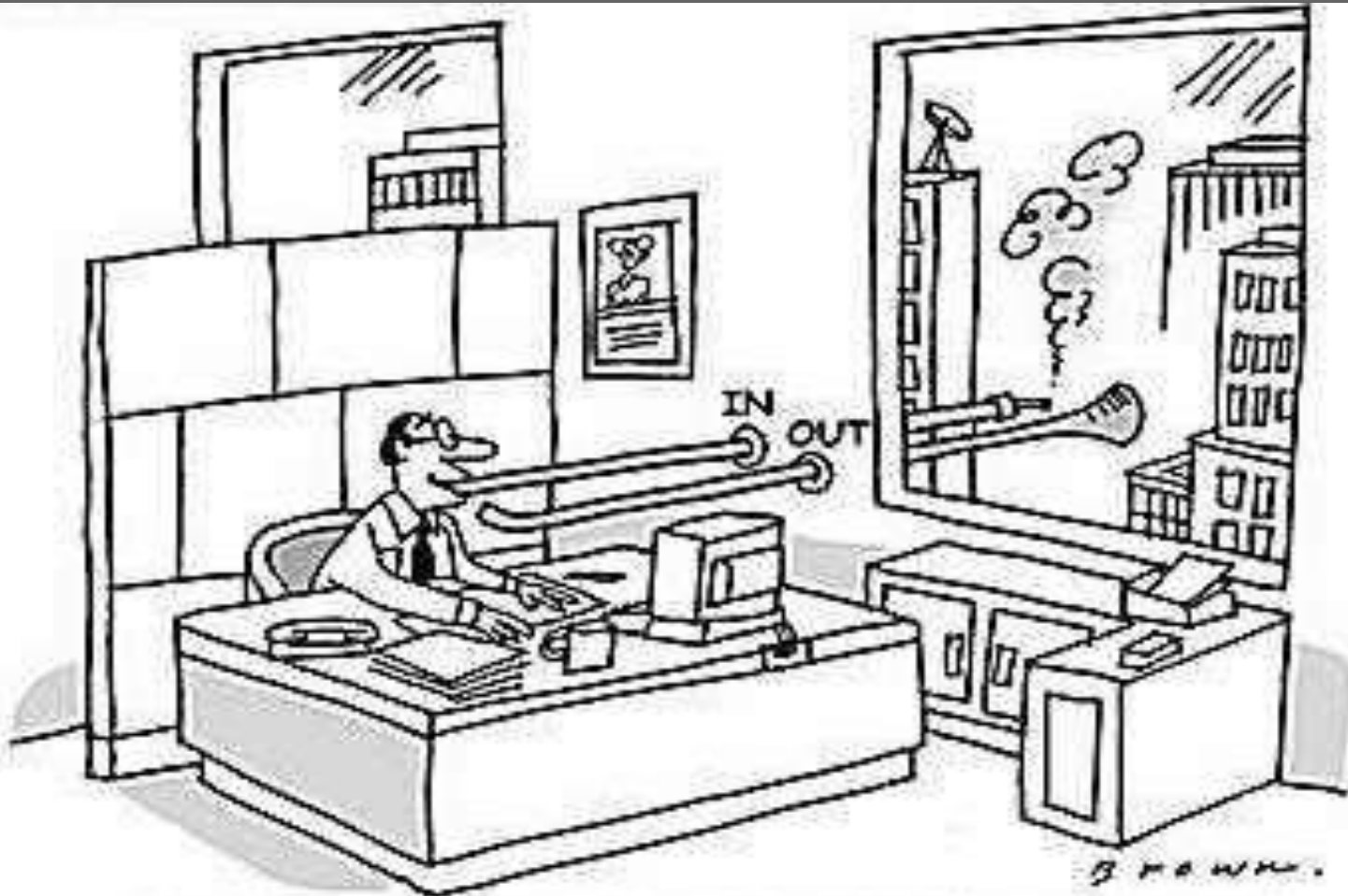
THE 'CLEAN OFFICE AIR' SMOKING DEVICE