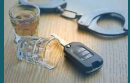
Dram Shop Liability