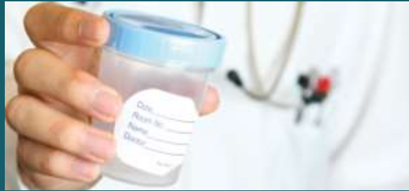
Labor & Employment Law